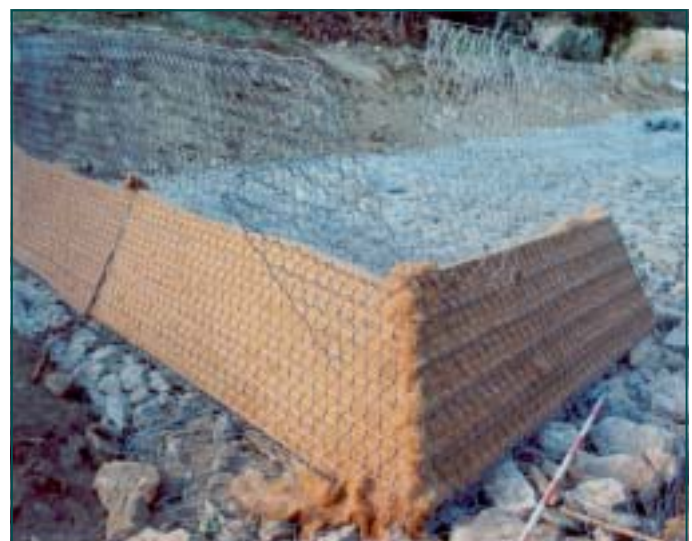
Figure 3 - Rockfall protection embankments terminal