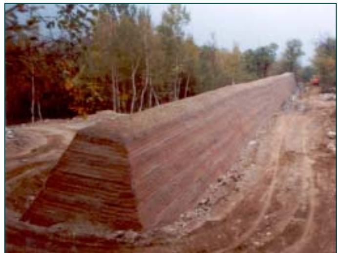
Figure 2 -- Rockfall protection embankments application